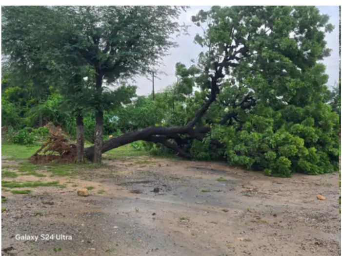
Galaxy S24 Ultra

Kutch After heavy rain in Kutch district on Thursday, the rain has taken a break today. But, now after 48 years, the district is threatened by a rare storm. Possible Cyclone 'Asana' is likely to lash Mandvi, Abdasa and Lakhpat talukas of the district as it moves towards Kutch. Due to which the people living in mud houses and huts in these three talukas have been appealed by the district collector to move to a safe place and the people also living in these types of accommodation should take shelter till 4 pm today. The Chief Minister also held a meeting at the State Emergency Operation Center on Thursday night to review the possible storm situation. Three signal numbers have been put up at Mundra, Kandla and Jakhou ports due to possible storm in Kutch. Mobile network has also been severely affected due to heavy rain and wind in Mandvi, Abdasa and Lakhpat talukas.